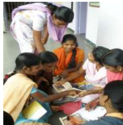
Students lead a workshop on Media and Gender Justice with peers.