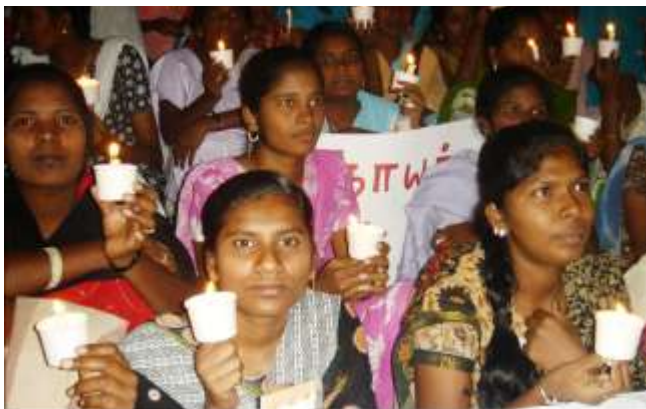
The Vigil: experiential learning makes human rights come alive!

The students relate to discrimination against Jewish people in the movie like their own situation of belonging to two minorities: Christian and Dalit. They are perplexed at the depiction of Christians as the majority oppressor in Fiddler . They think of Jesus as the embodiment of Christianity, so to think of him as Jewish opens their minds. They see the "apartheid" in the Russian village as similar to their physical exclusion from the caste village in their own locations. The students become aware of their rights with a new perspective when they find these parallels in other settings. They know their local version of violations but knowledge of an international code to protect them is new and exciting. UDHR comes alive!